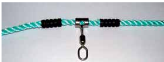
5,5 mm Rotoline 3 strand Scanline