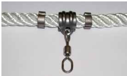
11,5 mm 4 strand Scanline