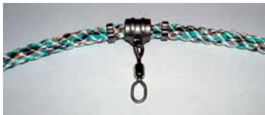
9 mm 3 strand Scanline