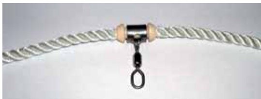
7,2 mm Drumstopper 3 strand polyester