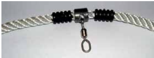
9,2 mm 4 strand polyester