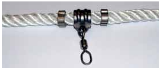
9 mm 4 strand polyester